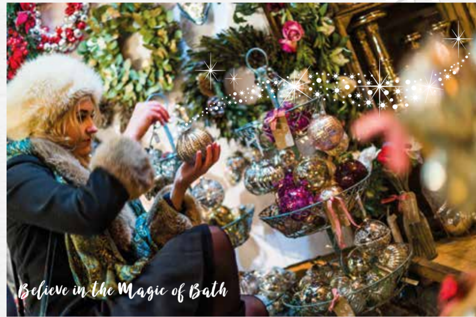
Believe in the Magic of Bath

The festive season has arrived, and with it the largest shopping event in the South West – Bath's Christmas Market.