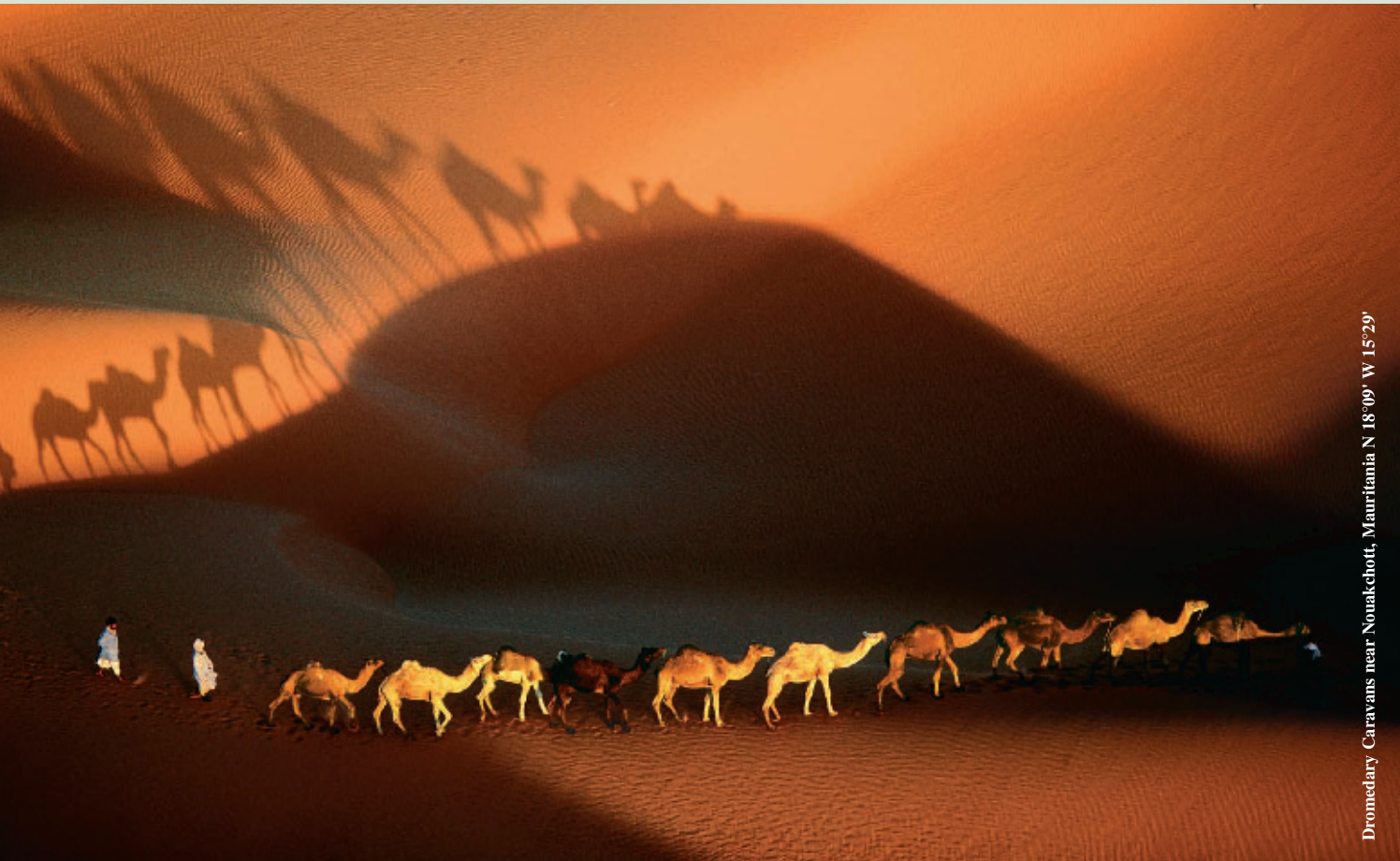
Dromedary Caravans near Nouakchott, Mauritania N 18°09' W 15°29'

“Genuinely fascinating and highly recommended ” DAILY TELEGRAPH